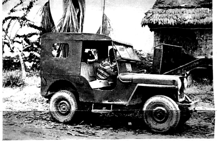
Walter Lauerman in the 1948 Jeep which is invaluable in the work. It is about five miles to the boat house where the boats and motors are kept.