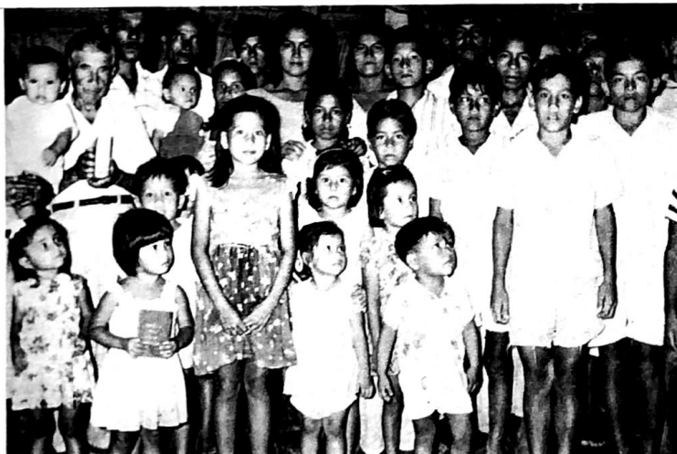
The Mission point at Orellana a few miles down the Amazon River and then inland a few minutes.