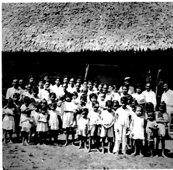
Crowd at San Pedro Baptist Church. This church is the farthest down the Amazon River from Iquitos, Peru.