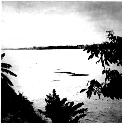
Logs and limbs etc. in the Amazon River. When the river is rising these things float off the bank and down stream. The river was full on our trip down river.