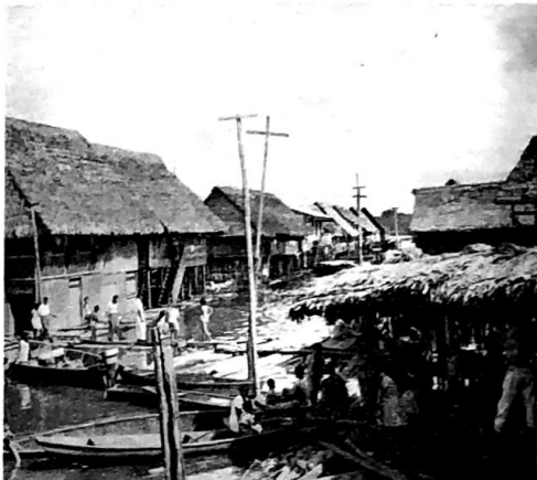
Another group of houses in Belen, Iquitos, Peru. Many who live here heard the Gospel.