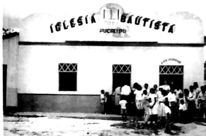
The newly painted Baptist Church building in Pucallpa, Peru. This is a rented building. This church has called Juan Castro as pastor.