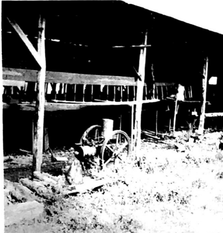
The John Hatcher LAUNCH under construction under this shed in Manaus. The bottom is finished and the side boards are being put on by the workmen you see in the picture.