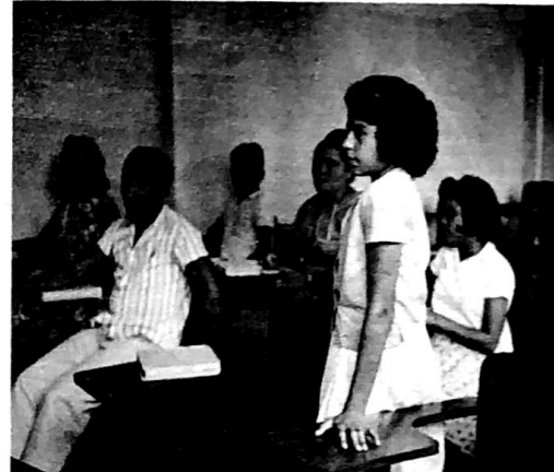
Preparatory class for High School entrance examination for the new Baptist High School in Manaus, Amazonas, Brazil.

We believe that women should keep silent in public mixed assemblies and that God calls only men to preach. We believe in the premillennial second coming of Christ, we believe that Heaven is a real place and that Hell is a real place. We believe in the Trinity of God and that the Devil is a person, and that there will be two resurrections, one of the just and one of the unjust.