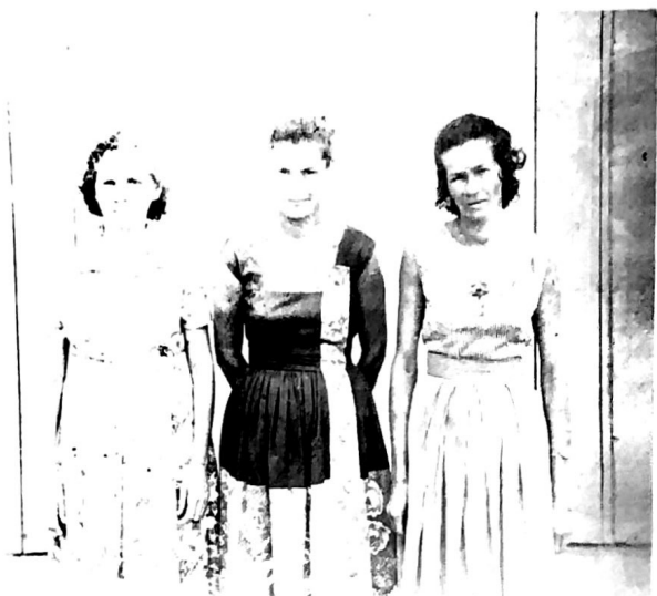
The three Baptist teachers for the new Grade School in Colonia, Acre, Brazil. They will teach the first four grades and there will be two classes of the first grade making five classes in all.