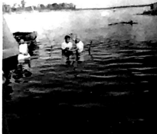
Bruce Lunsford Baptizing Nehemias Duran, Pucallpa, Peru.