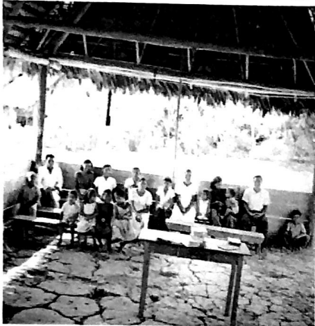
Inside the new church building at Hojeal, Peru showing the cracks in the dirt floor.