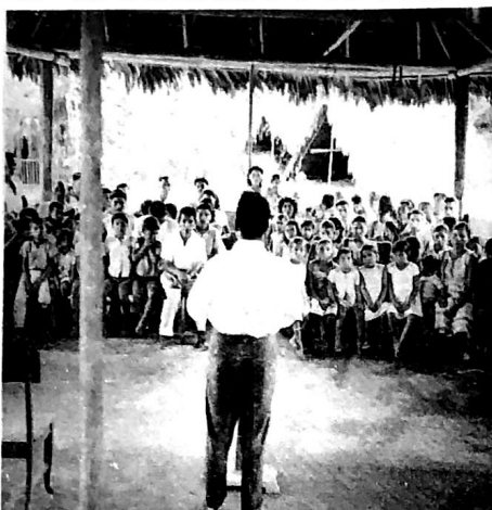
Inside the new church building at Hojeal, Peru showing the new concrete floor. Before and after pictures.