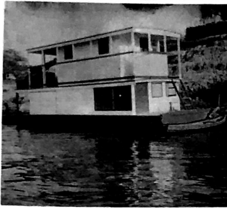
BEFORE: Side view taken from the Aluminum boat in the Nanay River. All equipped except instrument panel.