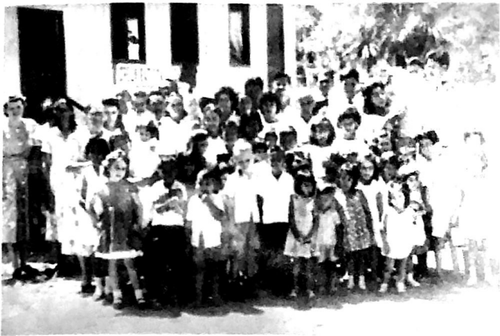
Sunday Morning crowd at the 14th of December Baptist Church, Manaus, Brazil.