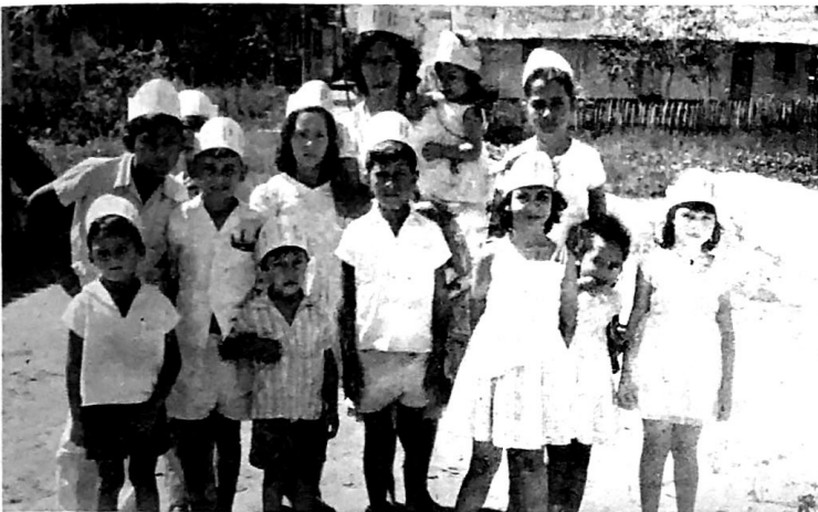
Class of Boys and Girls at Vacation Bible School of the 14th of December Baptist Church.