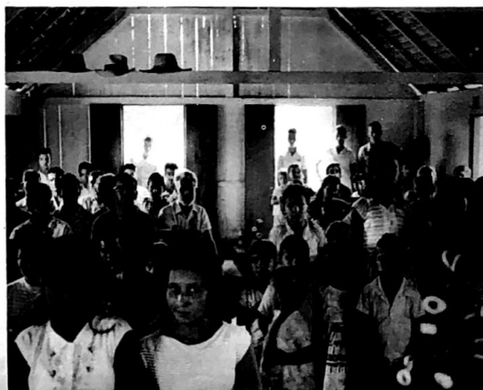
Part of the Morning crowd inside the Moropirango Baptist Church Building, Acre Territory, Brazil.