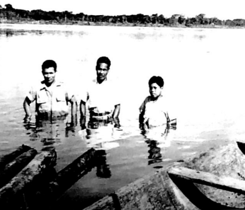
Purification baptizing for the first time at Astoria. The work in Astoria is picking up.

DON'T FORGET To Send Offering —for— STATION WAGON!