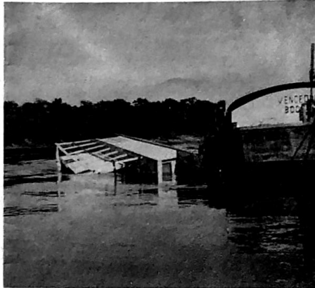
AFTER: Here it is minus the top which has been pulled off. The barge on the right worked three days and nights and then gave up.