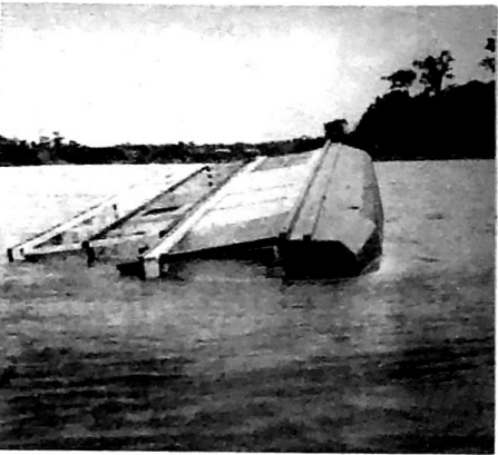
AFTER: This is the way it looked after the storm subsided and Brother Mayfield photographed the houseboat on its side in eight feet of water.