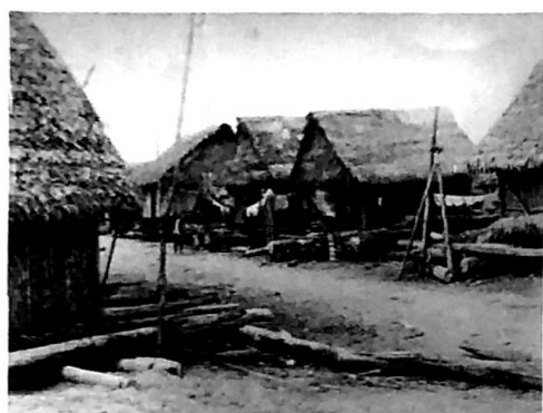
Some of the houses in Iquitos, Peru, near where Del Mayfield preached in a home similar to these.