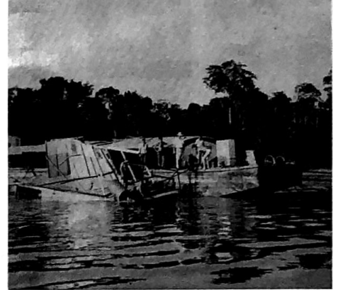
AFTER: Still later, filled with both water and sand and it could not be raised because of the weight. The Navy pulled it ashore.