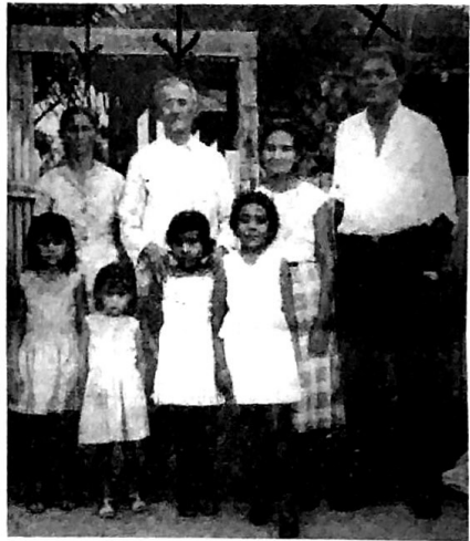
The couple under the arrows 'got legally married so they could be baptized at Careiro. The man under the X is a Preacher from the 14th of December Church.