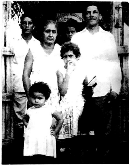
The couple in front got legally married so they could be baptized June 9, 1962, at Careiro, a mission point about three hours from Manaus, Brazil.