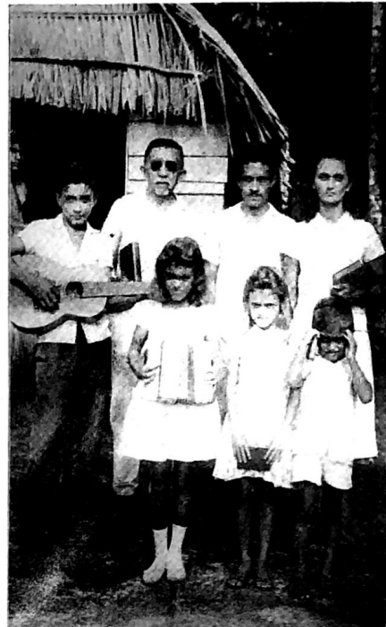
A family of believers at Januaca. The man with mustache holds services here regularly.