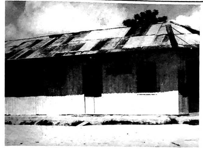
The building in Pucallpa, Peru rented by Brother Lunsford and Brother Mayfield for