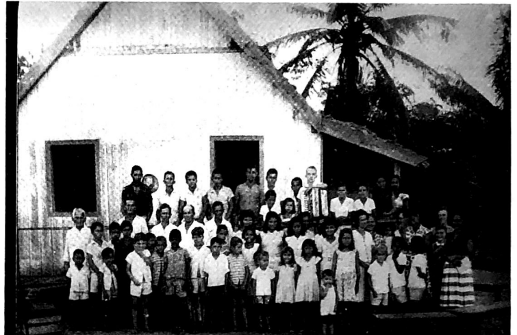
A crowd at Colonia about 45 minutes walk from Japiim. This is a good mission point and Brother Craig-low plans to spend some time here and maybe buy a building for services and a future church.