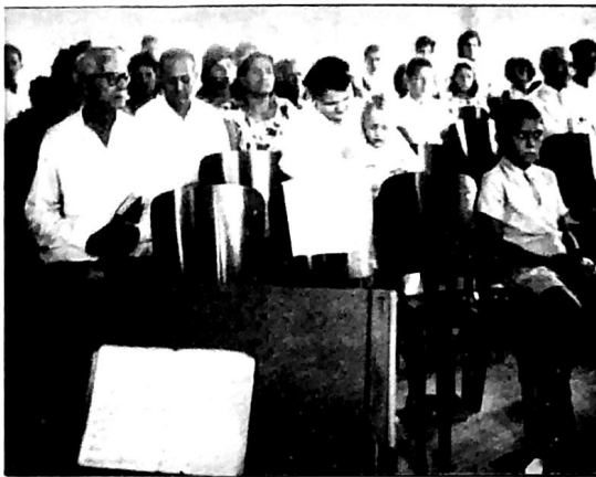
Looking from the organ seat, this is part of the crowd that attended the Bible Conference in Manaus, Amazonas, Brazil. The services were held in the new Preacher's School Auditorium.