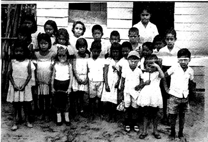
GRADE SCHOOL OF 14th OF DECEMBER BAPTIST CHURCH. The teacher is the young woman standing in the rear. We ask, just why should Baptist children and children of Baptist homes have to go to a Catholic School not get any Schooling? Thank God for these churches that are starting their own schools for their own children.