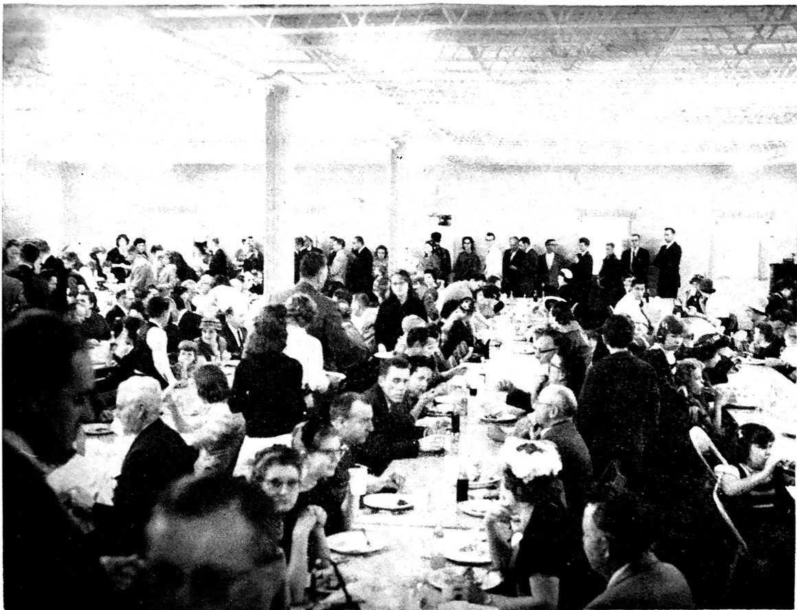
Part of the crowd eating Thanksgiving dinner in the beautiful new Annex Building of Grace Baptist church during the Thanksgiving Conference. The people standing in the rear are the last of the second shift waiting to serve themselves and eat when the tables are vacated.