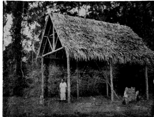
The partially finished new church building at Campo de Santana. The members of church built this themselves.