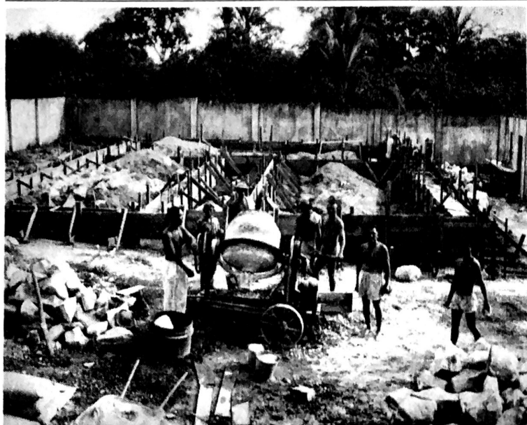
Good views of pouring the foundation for the new preacher's School building in Manaus. This picture taken from the rear of the church building.