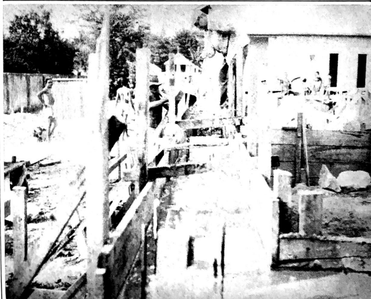
This picture taken from the rear of the lot showing the rear of the church building. Please send special offering to help build this school.