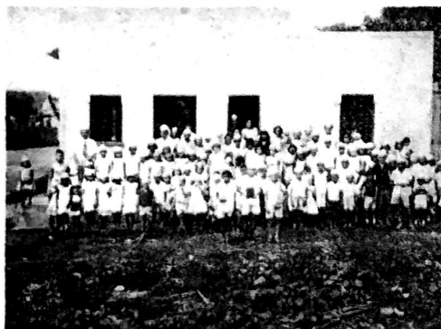
Zion Baptist Church showing children outside the building that attended the Vacation Bible School by Harold Bratcher.