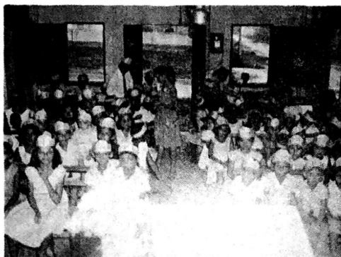
Inside Zion Baptist Church showing the children inside during class session. Many children reached with the Word of God.