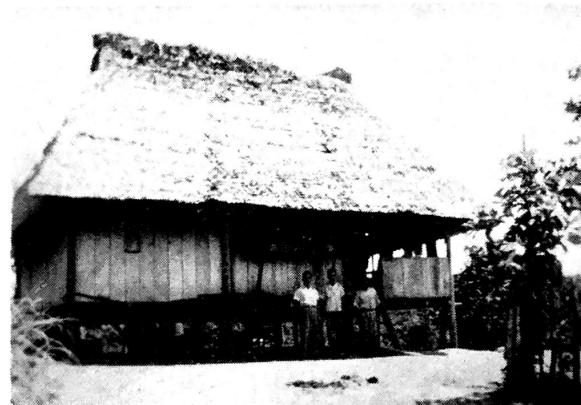
This is a home on the river near Iquitos, Peru where the Missionaries stop and hold services in the man's house. This is a mission point and many hear the gospel here.

the pupils of our school learned much about the Bible during the school. Only one thing happened that caused me to feel a little sad. We announced during the school that we would have a commencement program on Friday night. We asked our pupils to bring their parents with them to the program. Practically none of the parents came. Almost all of the children were present but not the parents. This made us conscious of the fact that many times the hearts of the adults are hard. Pray with us that we may be able to reach the parents also.