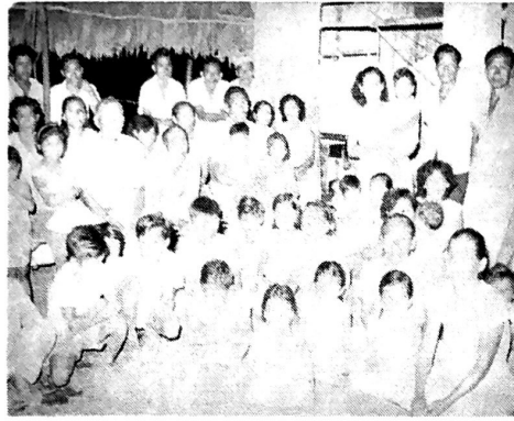
The Center section of the congregation at Hojeal. Pictures taken at night by Bruce Lunsford with a Polaroid camera.