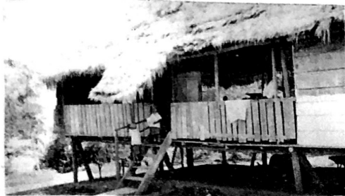
Church building at Astoria, on the Amazon river at the mouth of the Nanay river. This building was built by the native church members.