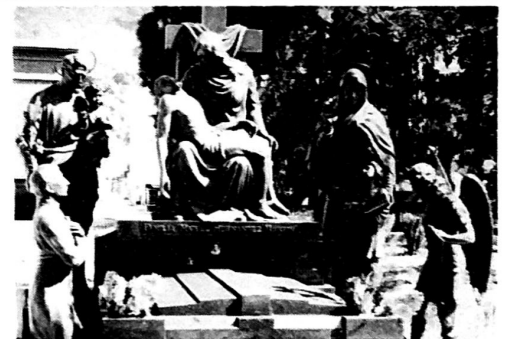
In contrast a Catholic tomb has Mary holding Jesus in her lap after he is taken from the cross. Their Christ is a helpless babe, helpless man hanging on a cross, or like this.