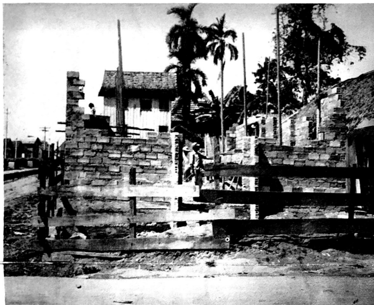
Front view of new Bethel Baptist Church Building, in Manaus, Amazonas, Brazil. As soon as the builder gets through with this building, Hatchers plans to start building the Preacher's School building. Bethel Church needs your help.