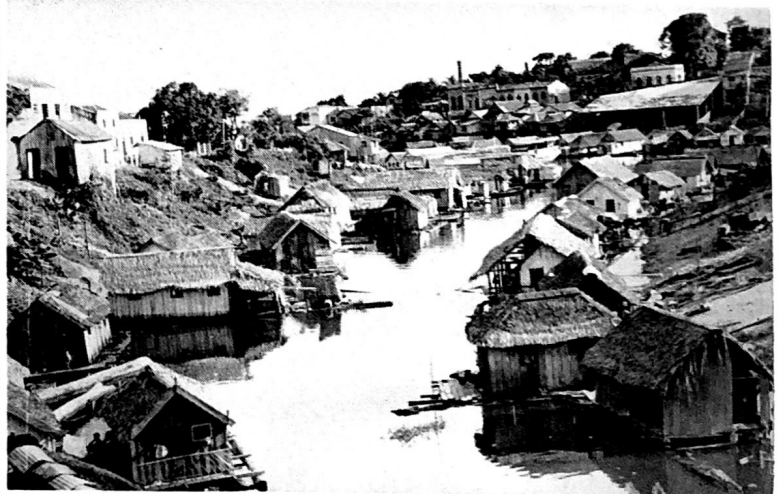
This stream runs into the Rio Negro river in Manaus, Amazonas, Brazil. The poor have the gospel preached unto them.