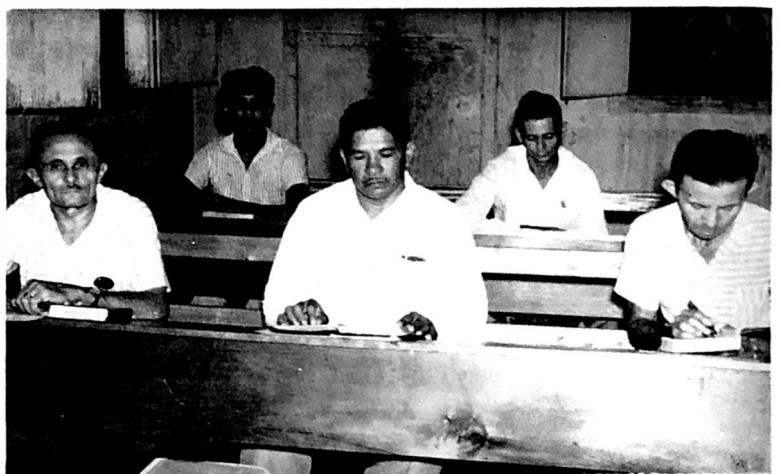
Five students at Cruzeiro do Sul, Acre Territory of Brazil. This is an extension of the Preacher's School in Manaus 2638 miles away. Hatcher and Bratcher plan a preaching and teaching trip here in August.