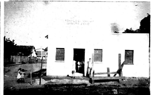
This is Zion Baptist Church building, Manaus, Amazonas showing the new Sunday School addition which has been built on at the right of the picture.