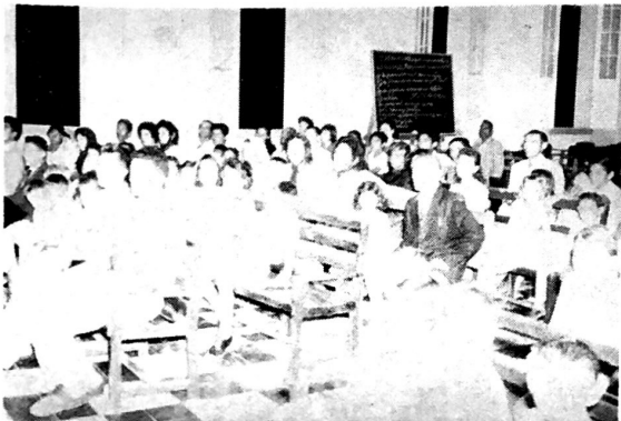
This is part of the crowd in attendance at the Bible Conference in Tabernacle Baptist Church, Manaus, Amazonas Brazil.