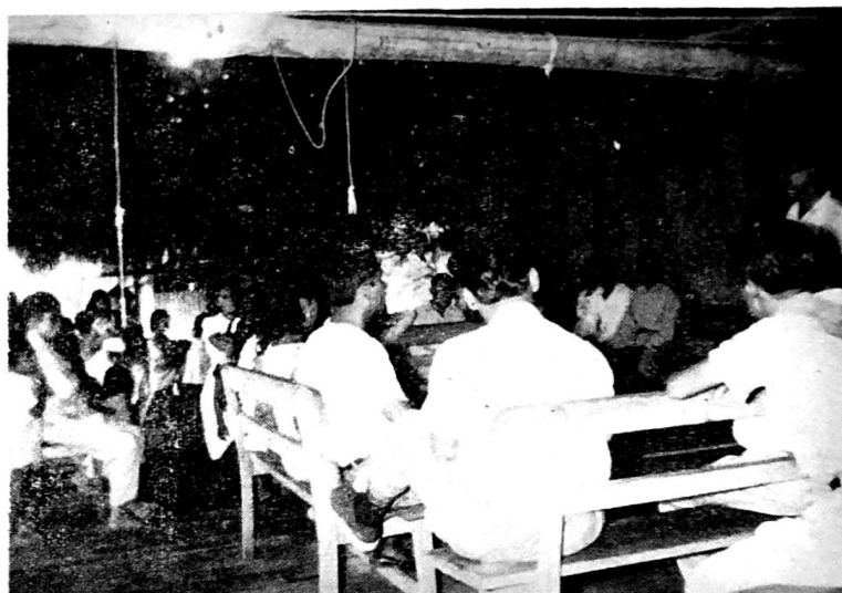
INSIDE. This is the inside of the house at the left during a preaching service. From a thatch house like this to a mansion above.