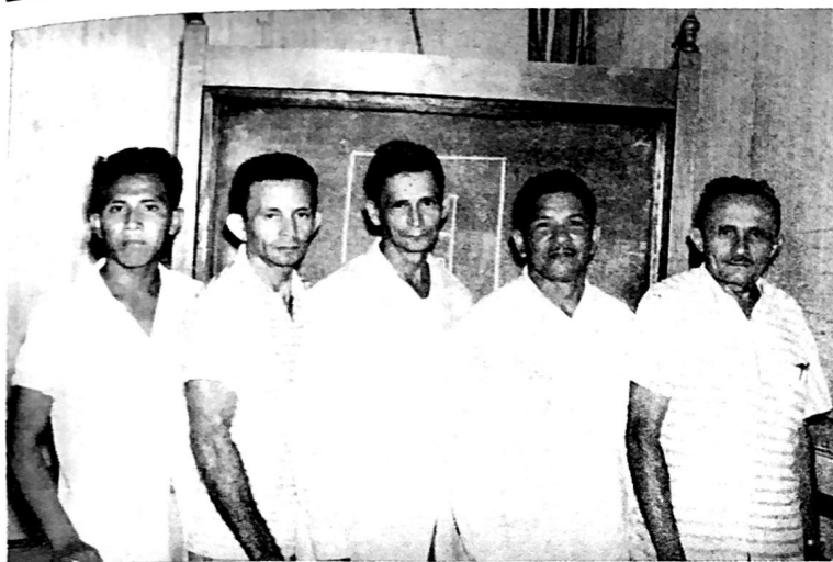
These are the five students that attended the two week's preacher's school at Cruzeiro do Sul. This is an extension of the school in Manaus. The young man on the left is an eighteen year old Indian and plans to come to Manaus to be a full time student in the preacher's school.