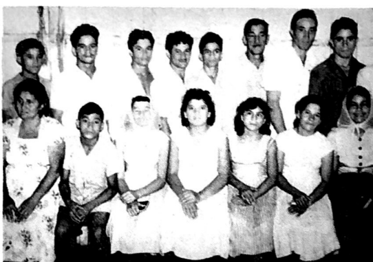
URUCURI BAPTIST CHURCH. 15 of the 18 charter members of the new Urucuri Baptist Church that was organized a short time ago across the Amazon river from Codajaz, 300 miles up from Manaus.