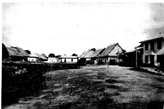
Tomshiyacu, Peru—Main Street. There are five streets like this in this city of three thousand people. This is a new mission place of great interest that looks promising.