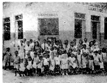
Sunday School at the First Baptist Church, Iquitos, Peru. There were 75 in Sunday School this day, but some got away and are not in the picture.