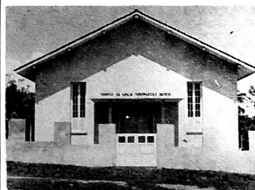
This is the new beautiful church building in Manaus that is finished and paid for in full. The breezeway and Baptist Bible School Building are to be built on to the back of this building.