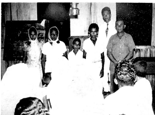
SALEM BAPTIST CHURCH. These were organized into Salem Baptist Church, June 5, 1959 at Petropolis in the City of Manaus, Amazonas. This makes us now five Baptist Churches in the City of Manaus: Calvary, Tabernacle, Bethel, Zion and Salem. This new church has a nice church building.