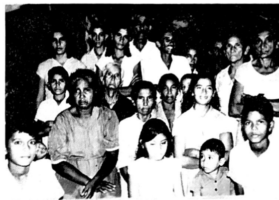
TERRA NOVA BAPTIST CHURCH. These were organized into Terra Nova Baptist Church, June 10, 1959 in the State of Amazonas, just off the Amazon River several miles from Manaus. This makes us 8 Baptist Churches in the State of Amazonas and the 15th one in Brazil.