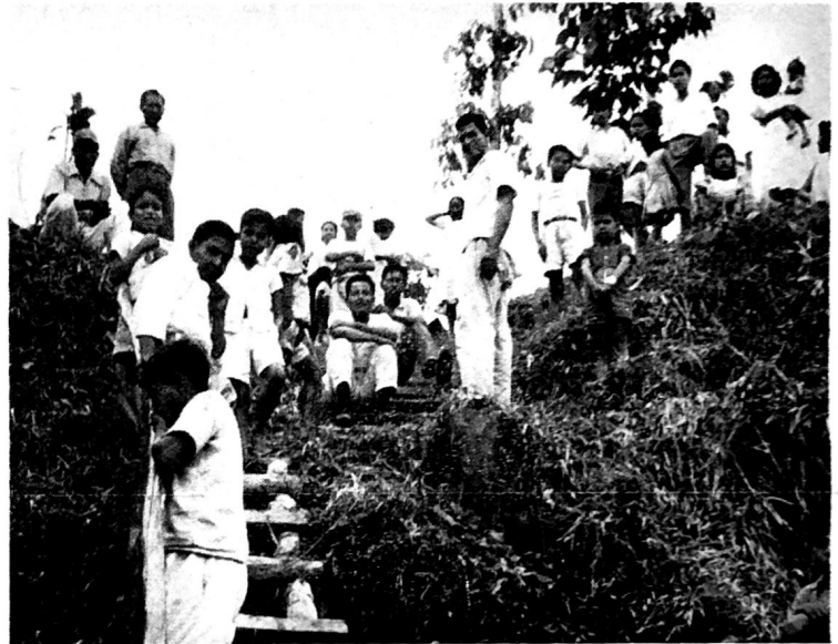
Part of the crowd watching the baptizing at Astoria. The bank of the Amazon is steep. Note the ladder