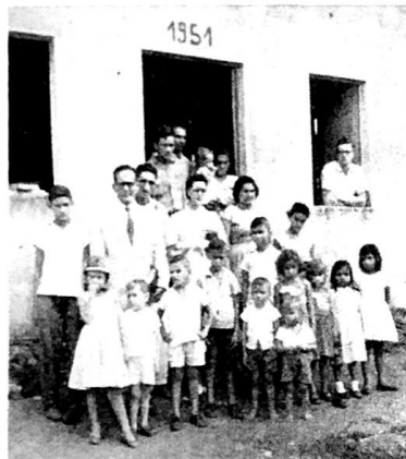
Zion Baptist Church, Manaus, Amazonas. This church is now with Baptist Faith Missions and makes our thirteenth church in Brazil and the fourth one in the city of Manaus.