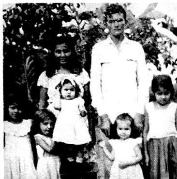
This is the man and family who owns the house at Curaizno. This man is a Baptist and his wife is saved and to be baptized soon. The missionary was entertained in this home.