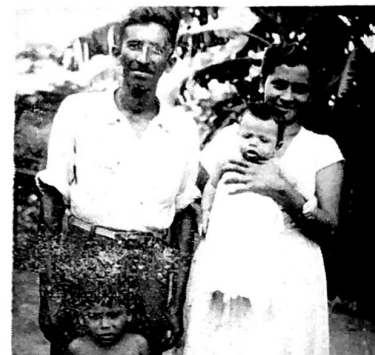
The son-in-law and daughter of the 70 year old man at the left. This man had alien immersion and was scripturally baptized recently and says he is called to preach. He preaches at Terra Nova when the missionary from Manaus is not there.