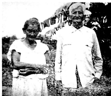
A close up of the 70 year old man that was baptized in picture to the left, with his wife. Three score and ten years old and then hears the gospel of redeeming grace, is saved and now a Baptist with others of his family.