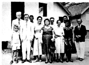
BETHEL BAPTIST CHURCH