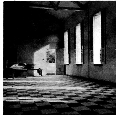
Inside view of floor looking out the rear door and showing part of baptistry opening. Note windows open and folded against wall.