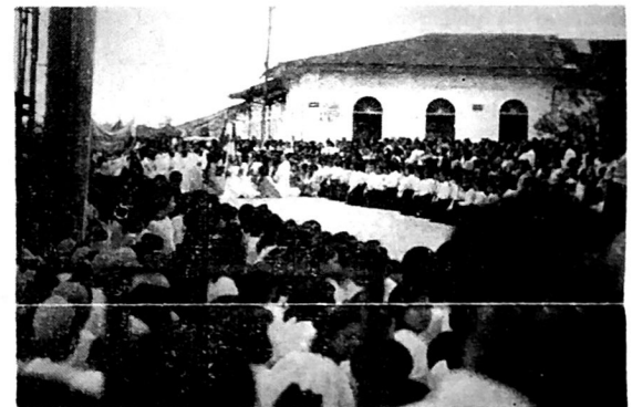
Catholic "Corpus Christi" day in Iquitos, Peru. Thousands attend. Note the people kneeling before an image. The school girls were obligated to attend.