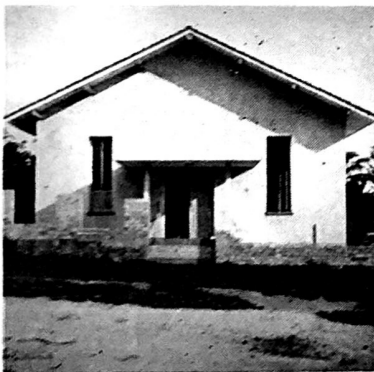
Front view of new Tabernacle Church building, Manaus, Brazil. To be dedicated July 4, 1958 on tenth anniversary of church, the Lord willing.