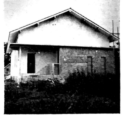
Rear view of building. The baptistry and two toilets are bricked in and are on the outside of the building. The Breezeway and Preacher's School are to be built back of this.