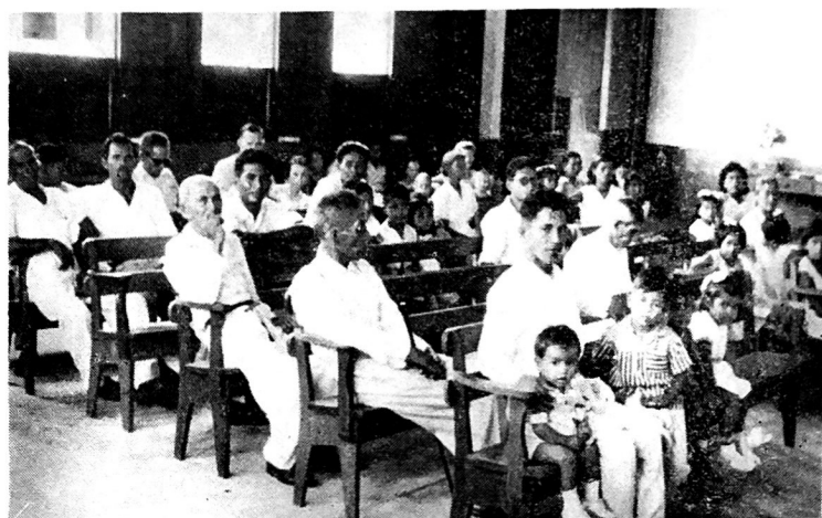
The morning service in the First Baptist Church, Iquitos, Peru, March 20, 1958. There were 13 men present in this service.