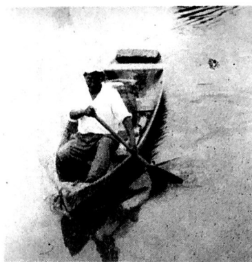
The hard way. This is how the journeys have been made in the past. Our Brother sits in the front of the boat and paddles to his destination, which sometimes takes him all day and sometimes more than a day.