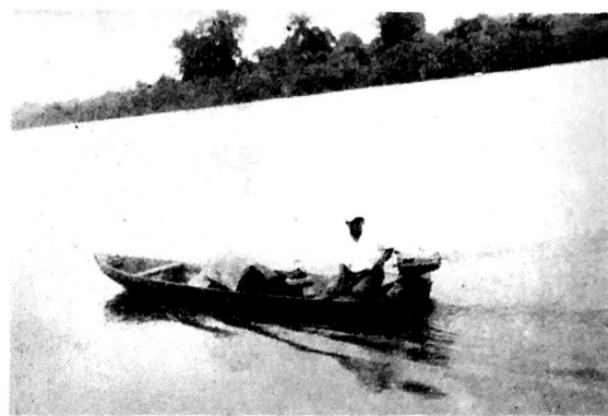
The easy way. Simon Gaima is starting out from "Morona Cocha" lake at Iquitos. From "Morona Cocha" at Iquitos, to "Mapa Cocha" up the Nanay river is: one day by paddle or two and one-half hours by motor. This boat and motor are the property of Baptist Faith Missions.