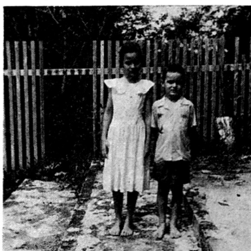
The Hatcher children just after they were baptized. What a joy to a missionary's heart to see his own children saved, and baptizing them.