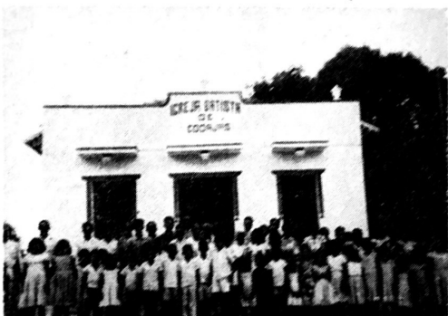
After the Sunday morning service in front of the new building. The words above the door in Portuguese are: IGreja Batista de CODAJAZ. In the same order in English are "Church Baptist of Codajaz". This is a good example of what your mission offerings has done by the grace of God. This picture was taken just after Royal Calley had preached to them.