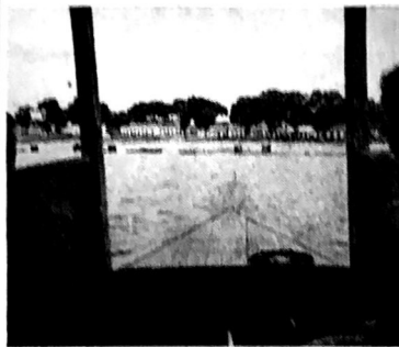
After getting off the large river steamboat, you reach Faro in a smaller boat. This is how Faro looks on the bank of the Lhamonda river as you approach it.

It is almost impossible for people to imagine the difficulties of the interior life in the Amazon Valley. When we left Manaus we did not take anything in the way of food for two reasons: first, we wanted to see what it was like to live as the people live and second, canned goods are too expensive to buy. The house we have rented in Faro is one of the best in Faro, it had a floor of wood. As I said before we had hammocks for beds. In the two months that we were there we had beef two times, pork two times, and the rest of the time we had fish for meat most of which was salted. One day one of the brethren and I killed a duck, and I was able to buy a couple of chickens. We had green vegetables two times in two months, and tomatoes once. But our regular diet was dried beans, and rice and believe me I haven't wanted a bean since I've been back. But maybe we didn't lack too much in the meat line because the beans had a large number of little animals in them.