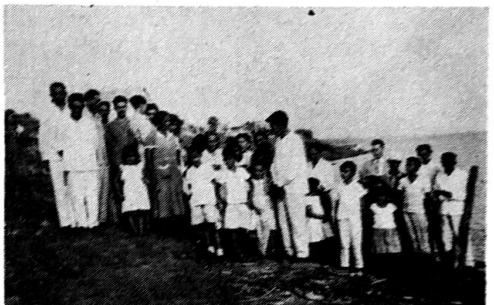
The people are singing during the baptism. This is on the bank of the mighty Amazon River at Codajaz, Brazil, 300 miles above Manaus.