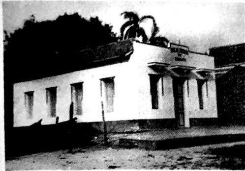
This is the new church building at Codajaz, Amazonas, Brazil on the bank of the Amazon River about 300 miles up river from Manaus. This is a brick building plastered outside and inside and it has a tile room and a tiled floor. Note the door and windows with wood shutters. No glass in the windows. This is the nicest building in this jungle village.