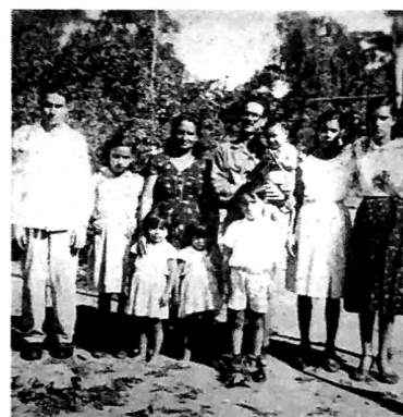
The man and wife in this picture were saved at Alegria. It is in their house that services are held. Also in the picture are their children.