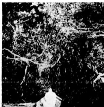
You may wonder why this picture. This shows the bow of the canoe as they traveled in a small stream through thick underbrush on their way to a place called Terra Santa to preach the Gospel of the Lord Jesus Christ.