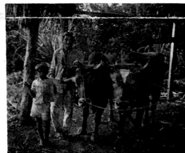
This is the owner of the house with his son at Floresta where the services was held. The oxen are walking around in a circle pulling the large pole that turns the rollers that grinds the sugar cane. The juice is cooked and made into brown sugar.