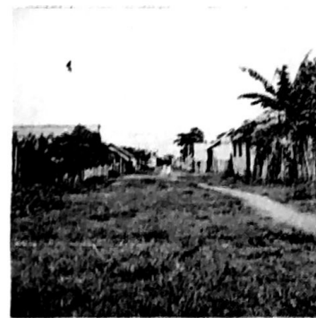
They have arrived at their destination. This is a street scene in Terra Santa. With a Launch to travel and live in, and then with an outboard motor and canoe many small villages like this can be reached with the Gospel. The only way to get to these places is by boat.