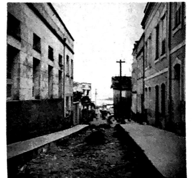
This is the picture of the street that the Hatchers live on. The name of the street is "Beco do Ceu" which means "Street of Heaven". Here you are looking into the Rio Negro river beyond the end of the street. Mrs. Hatcher is leaning out the window of their house at left of the picture.