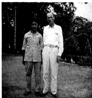
Both Candidate and preacher go to the Parana dos Mouras river.