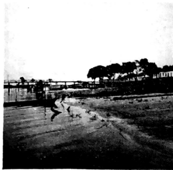
The beach at Faro is beautiful and there is always a cool breeze from the river. This is where we land when we arrive by boat.