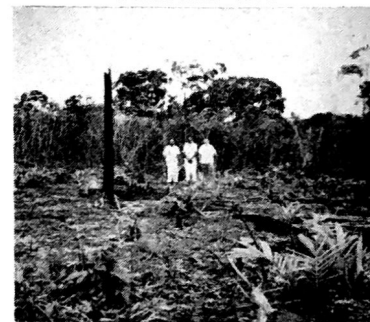
Plot of ground cleared by the Brethren at Japiim as a site upon which to build a new church building soon.