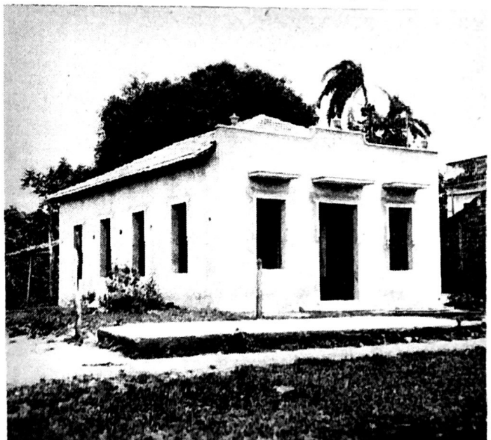
This is the new church building at Codajaz, Brazil on the Amazon River about 300 miles up the river from Manaus. The windows and doors were made in Manaus and are shipped by boat and should be installed soon. The church hopes to be worshipping in the new building by January 1956 the Lord willing. The building is small but the nicest one in the town.