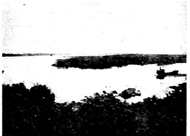
This picture was taken from a high hill at the mouth of the Nanay River. The river to the left is the mighty Amazon River, and the one to the right flowing into it is the Nanay River. The ship in the picture is in the mouth of the Nanay River. This ship is from New York City and is loading on lumber to take to New York. The house in the water is built on logs and floats in the river near the bank. This is 3000 miles up river from the mouth of the Amazon, and it is still wider at its narrowest place than the Mississippi River it at its widest place. In the far background is an island about 7 miles long in the Amazon River and the river is still wider on the other side of the island. Iquitos, Peru is on the Amazon River a short distance up river from this picture.