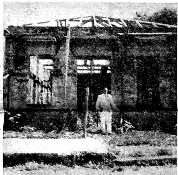
This will give you an idea how the new church building at Codajas is coming along. This is built out of tile brick and will have a tile roof. The walls will be plastered and painted both inside and out. Pastor Miguel Ibernon standing in front of building.