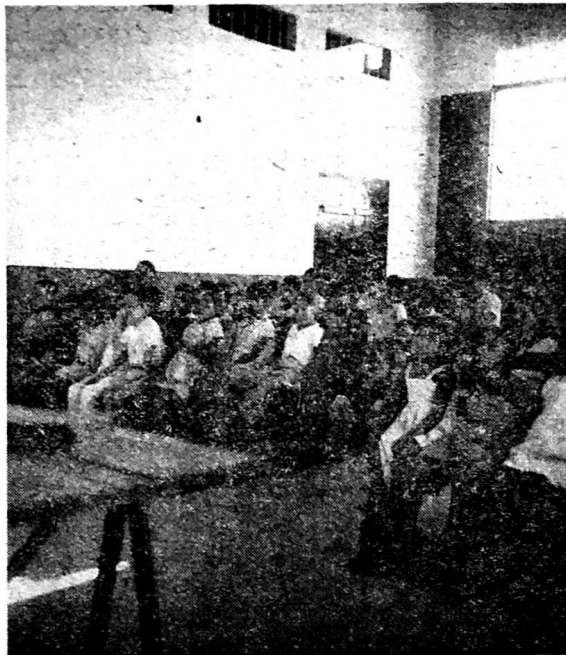
View of the boy's side of the Vacation Bible School. This is inside the church building in Iquitos, Peru. Enrollment, 70; average attendance, 60.