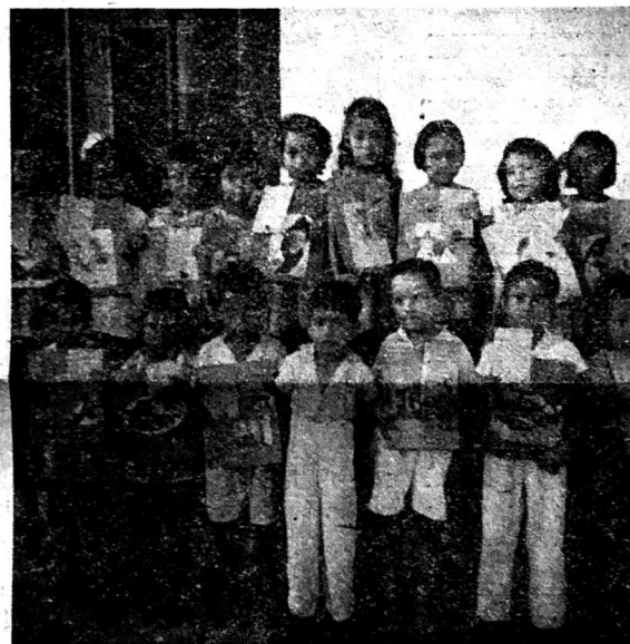
These little tots are holding their books and memory cards with stars for the Bible verses memorized.