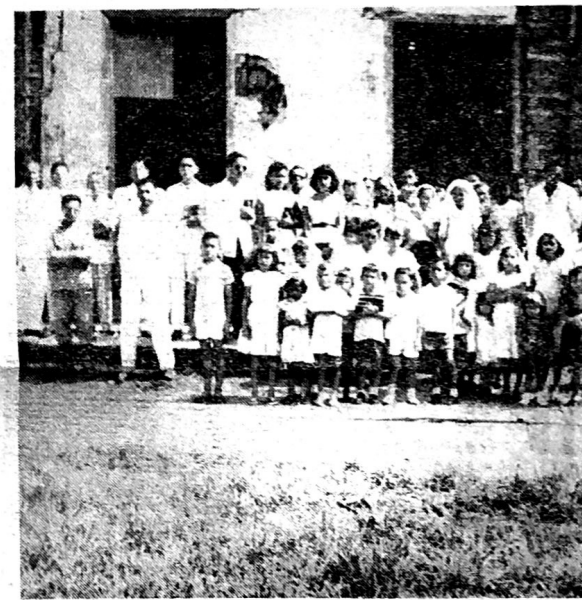
Intermediate girls with their hand work and memory verse cards, with a gold star for each verse learned and a red star for the motto which was Hebrews 4:12.