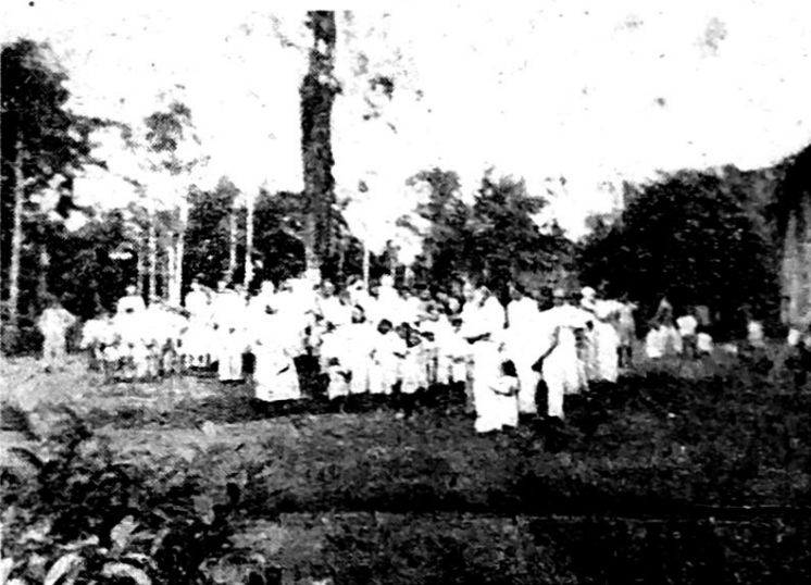
This is the Sunday morning crowd just outside the church building in Morapirango. This place is a half days journey by boat up the Moa River from Cruzeiro do Sul and then a walk inland of one hour. Large crowds attend the services at this place.