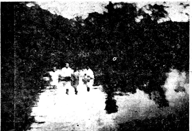
This is a baptizing in the Parana dos Mouros River at the home of the "Old Patriarch." This river is small but the water is high now.