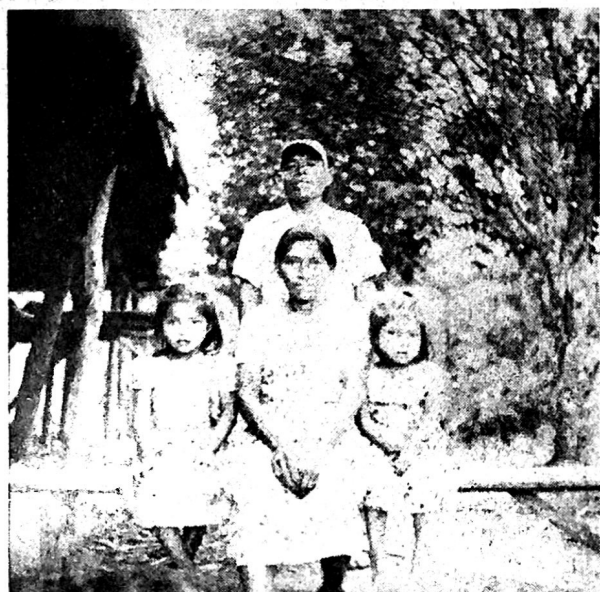
A family that the gospel was preached to. The man claims to be a believer but he is not legally married.