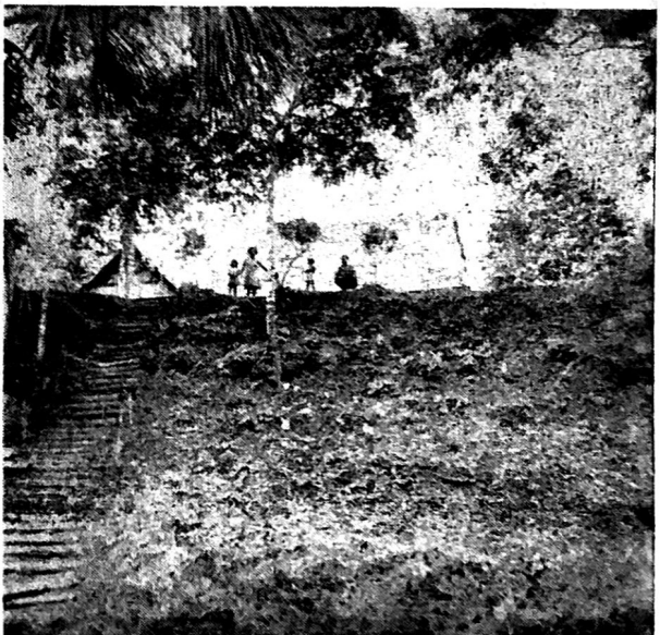
This is a picture of the first house in Polis. The bank doesn't look steep but it is. Note those on top of the bank waiting the arrival of the missionary.