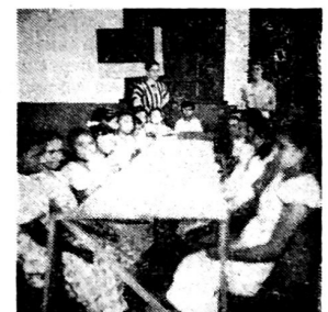
Scenes from D. V. B. S. in Iquitos, Peru.