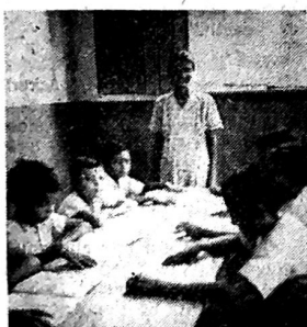
Scenes from D. V. B. S. in Iquitos, Peru.