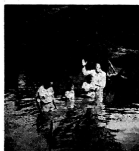
Brother Hallum baptizes the wife second.