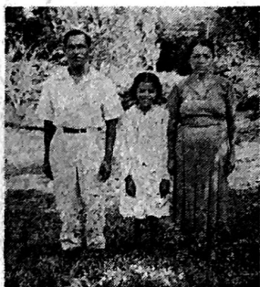
Here is the father, mother and daughter after being baptized. Thus you have the story in picture of a man and wife who have nine children getting married so as to receive Scriptural baptism.