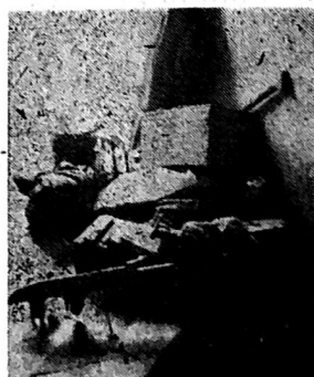
Here is what is taken on a missionary journey up river. Everything that is needed must be taken along: cot, food, thermos of drinking water (boiled), lanterns, outboard motor and gasoline.