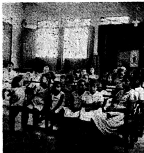
Partial view of the Sunday School attendance, First Baptist Church, Iquitos, Peru.