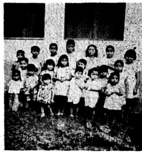
Nineteen children who received premiums for perfect attendance during one month.