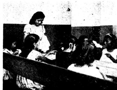
Primary girls at work.