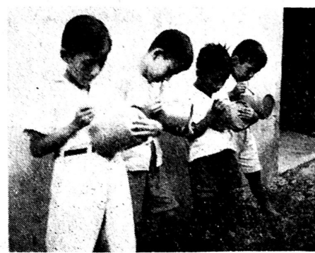
Some of the boys lettering cans to take home.