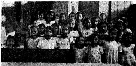
This is the other half singing.