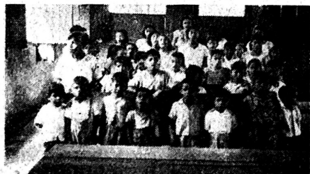
One half of the children singing.