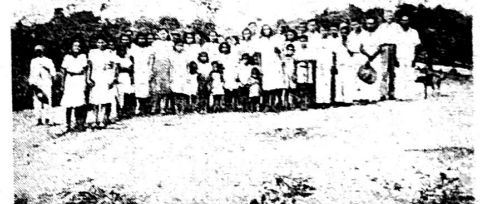
This is the group that the pastor found to preach to. One of these was saved and two other backsliders were restored to fellowship.