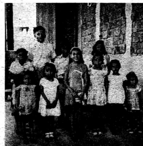
The children who received prizes for being perfect in Sunday School attendance in the First Baptist Church for the month of October.