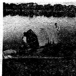
It rained on the journey and the boat needed a covering. After the rain Brother Hallum and Noe are removing the tarpaulin.