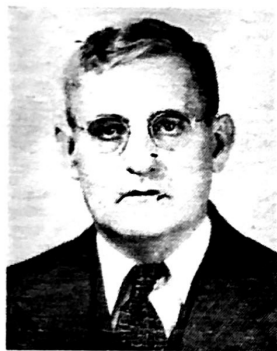
Manaos, Amazonas, Brazil July 5, 1948